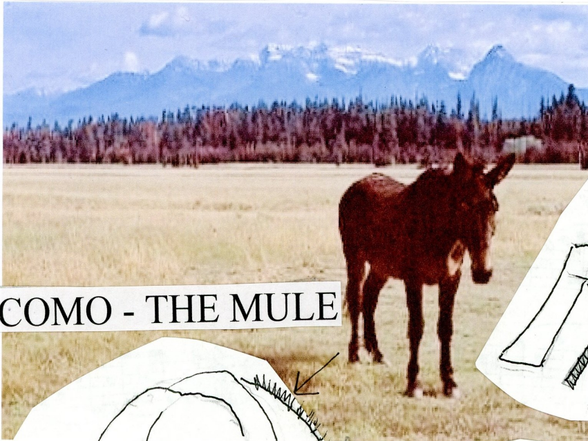
COMO - THE MULE